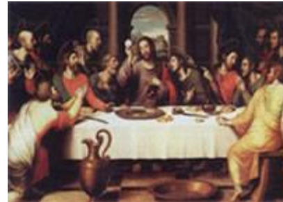
5. The Institution of the Eucharist (Love of Our Eucharistic Lord)