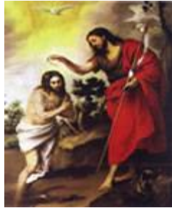
1. The Baptism of the Lord (Sacrament of Baptism)