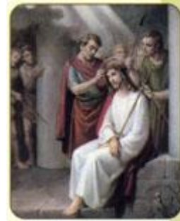
3. Crowning with Thorns (Moral Courage)