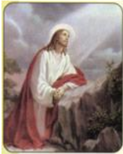
1. Agony in the Garden (True Repentance)