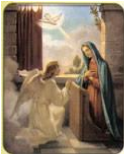
1. The Annunciation (Humility)