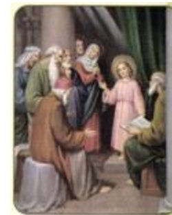
5. Finding in the Temple (Zeal)