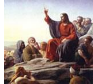
3. The Proclamation of the Kingdom (Desire for Holiness)