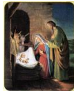
3. The Nativity (Love of God)