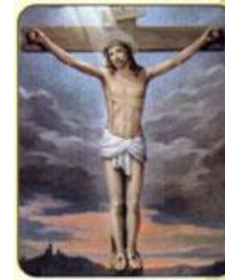
5. The Crucifixion (Final Perseverance)