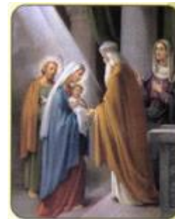
4. The Presentation (Spirit of Sacrifice)