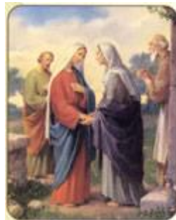
2. The Visitation (Fraternal Charity)