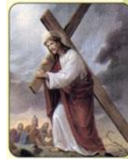
4. Carrying the Cross (Patience)