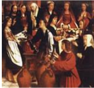
2. The Wedding of Cana (Fidelity)