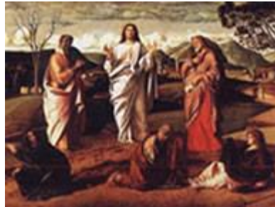
4. The Transfiguration (Spiritual Courage)